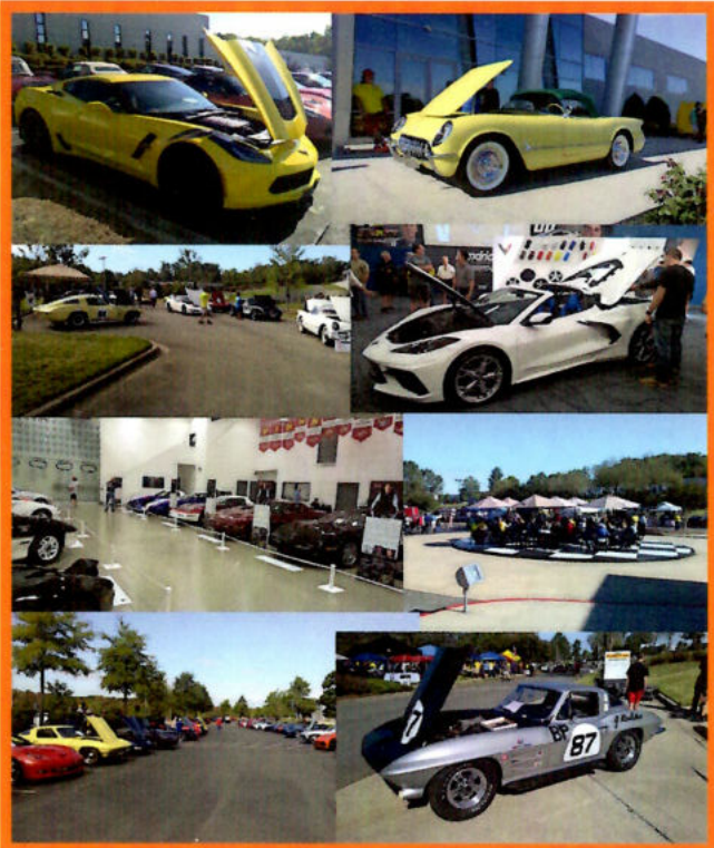
2019 SHOW PICTURES

Rick Hendrick Chevrolet of Naples Rick Hendrick Chevrolet Duluth Rick Hendrick Chevrolet of Buford Hendrick Chevrolet Shawnee Mission Rick Hendrick Chevrolet Charleston Rick Hendrick Chevrolet Buick GMC Rick Hendrick Chevrolet Norfolk